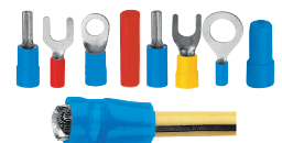
Form of crimping on wire.