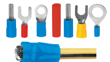
Form of crimping on wire.